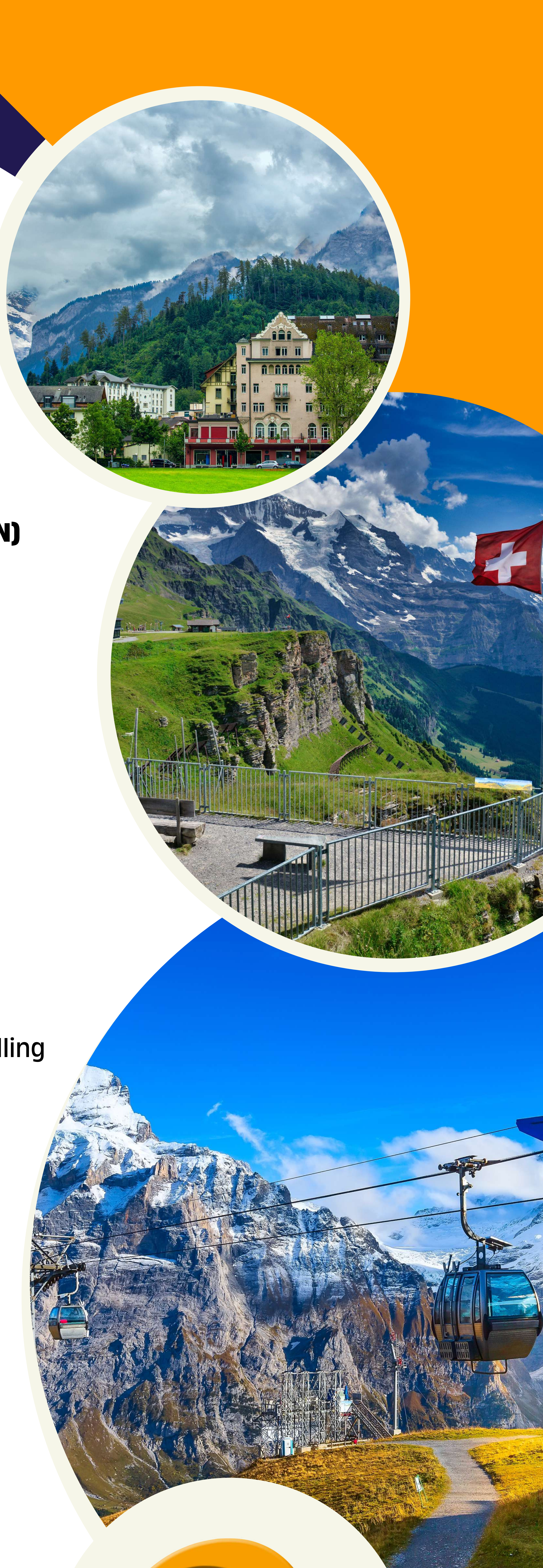
• You can also visit Jungfraujoch, the Top of Europe. (OPTIONAL, ON YOUR OWN)